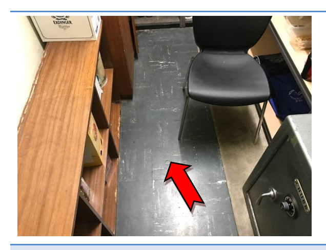
Photo Interior, ground level, strong room, green 1. floor covering – asbestos-containing vinyl floor tile.